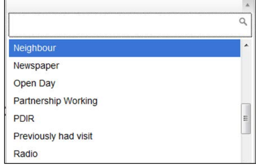
Choose "Partnership Working"