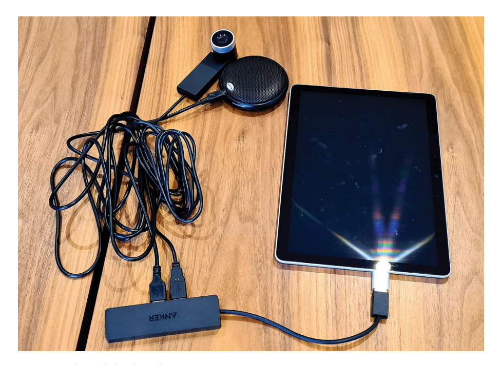
Fig. 2 Simple, mobile, clinical camera set-up